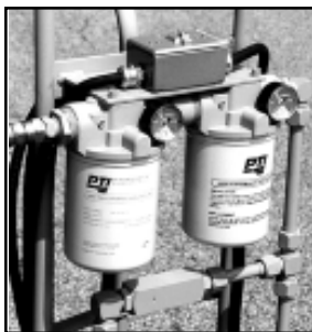
Pressure gauges let you know when a filter change is due.

Even new oil picks up contaminants during storage, shipping and transfer. Tanks, drums, pipes and hoses give off chunks, fibers or flakes – enough to drop the oil several grades in critical purity specs. A MOLDERS CHOICE Filter Unit brings your oil back into spec, helping you get all the speed and efficiency your presses can deliver.