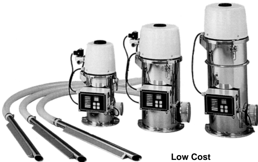
Low Cost Stainless Steel Loaders 3 Sizes