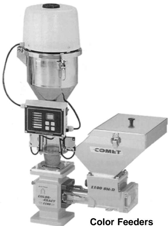
Color Feeders 2 Sizes