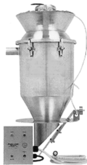
Whisper Loaders 3 Sizes