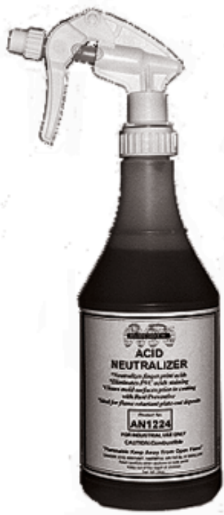
• 24 oz. bottle

Use our blanket order plan and save! Inquire for additional savings on larger quantities on all Aerosol & Bulk products!