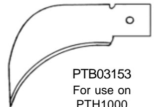
PTB03153 For use on PTH1000