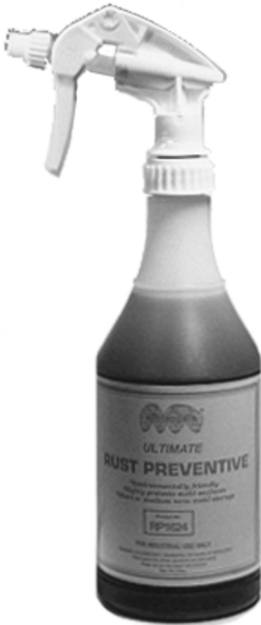
• 24 oz. bottle