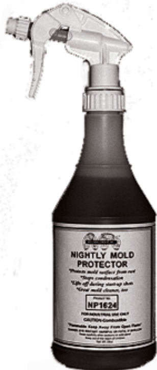
• 24 oz. bottle