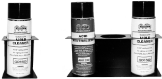
Three sizes – 1, 3 or 6 cans