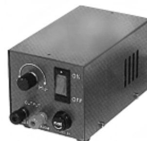
TRANSFORMER FOR ALL HEATED CUTTERS