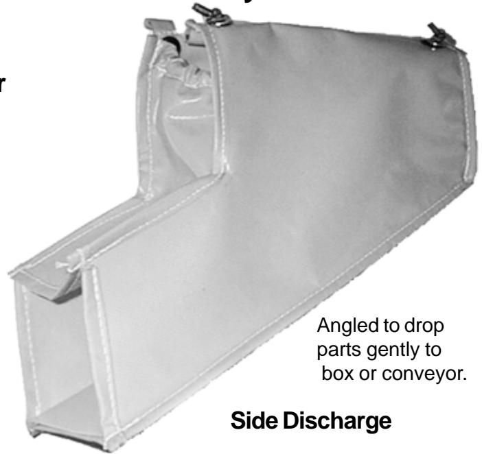
Angled to drop parts gently to box or conveyor.